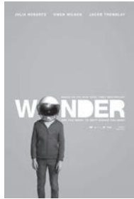
WONDER JUL 1-2, 4