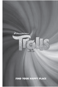
TROLLS JUL 8-9, 11