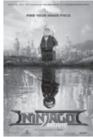
LEGO NINJAGO JUL 15-16, 18