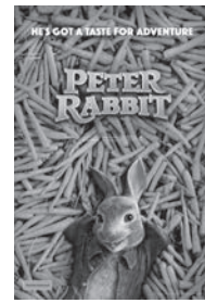
PETER RABBIT AUG 18-20, 22*