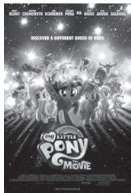
MY LITTLE PONY AUG 11-13, 15*