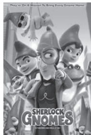
SHERLOCK GNOMES AUG 25-27, 29*