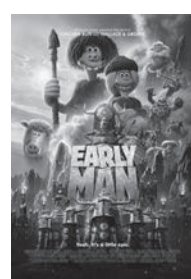
EARLY MAN JUL 29-30, AUG 1