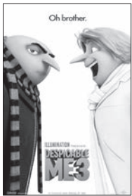
DESPICABLE ME 3 AUG 4-6, 8*